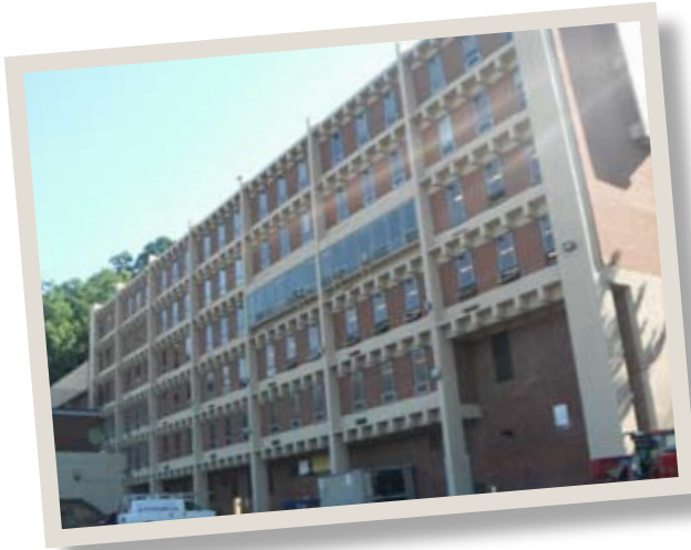
An early view of the school's temporary location next year.

A QUARTERLY NEWSLETTER FROM PROPEL SCHOOLS ISSUE #8